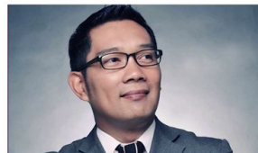
Ridwan Kamil MAYOR OF BANDUNG, INDONESIA