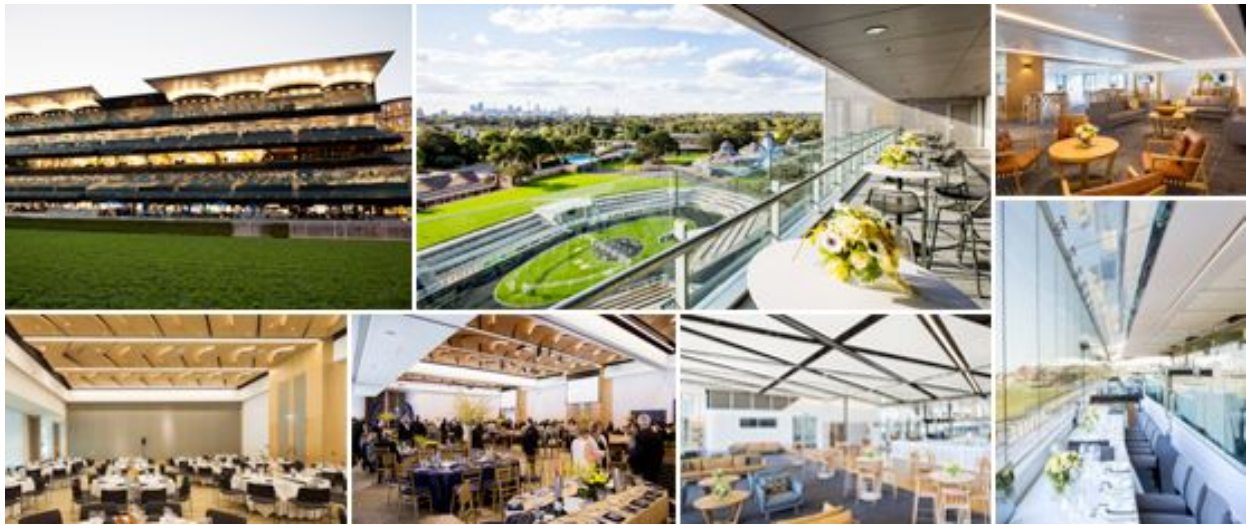
Royal Randwick Racecourse, venue for Startcon 2016. Download photos here .

StartCon will be held in Royal Randwick Racecourse on November 26 and 27 2016.