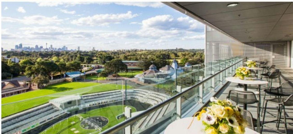
The new venue for Startcon 2016. Download photos here .