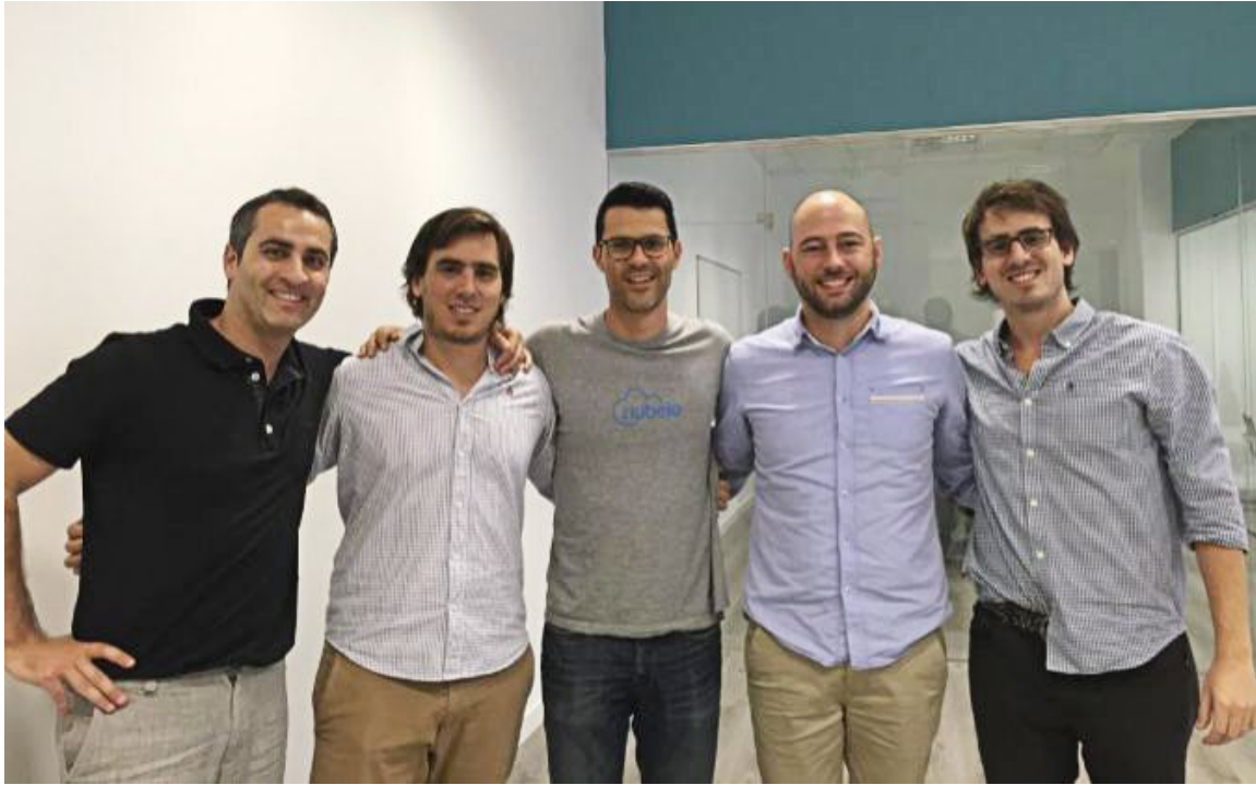
Nubelo & Prolancer Team

In July 2015, Nubelo took control of Prolancer.com.br, a Brazilian marketplace founded by Sergio Mendez Baiges and headquartered in Sao Paulo, in order to expand its reach to the Portuguese market. Combined they successfully grew to almost 750,000 registered users and over 122,000 posted projects.